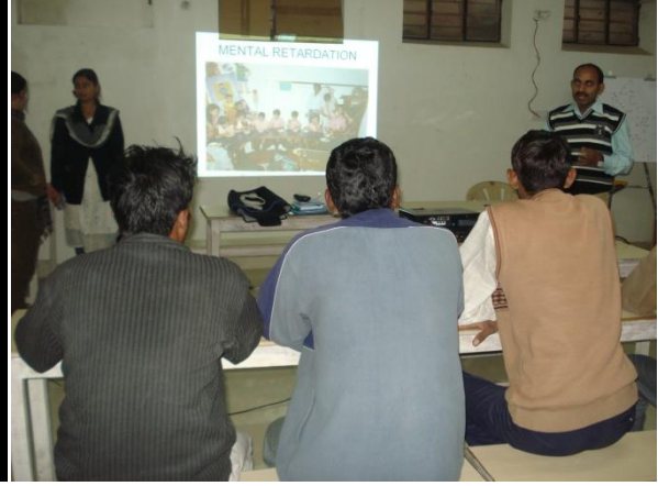
Training of staff at training center at SVF