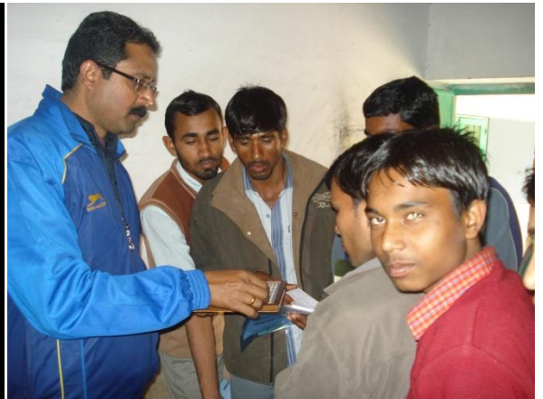
Training of staff at field and School for blind

At the end of the training, the trainees were asked to conduct a sample survey in two villages. Based on the sample survey and written test, 5 candidates were selected, who performed well in both the activities.